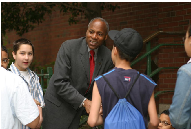
BY BILL PERKINS, FORMER CITY COUNCIL DEPUTY MAJORITY LEADER