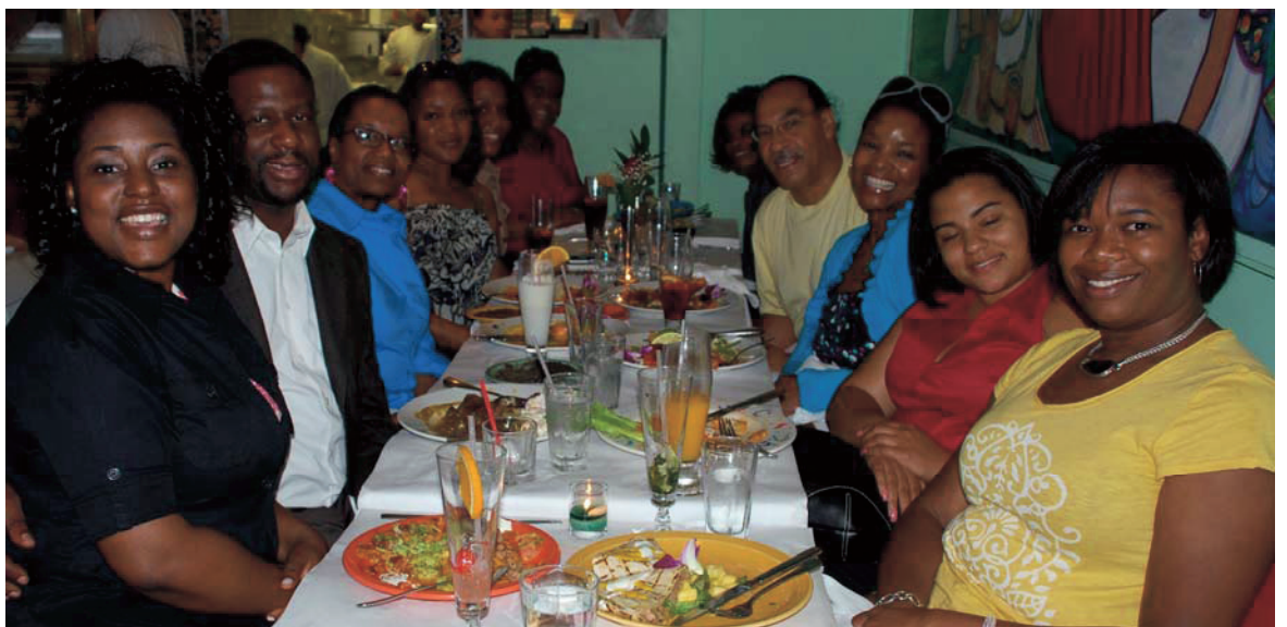
New Ventures Program participants celebrate their success in completing the program with a festive dinner on June 24, 2008.