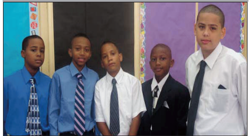
5 th grade boys look like dapper young men on "Moving-Up" Day.

students, academically, socially and creatively. They believe they can, and have indeed shown us that by their continuous efforts in achieving academic success.